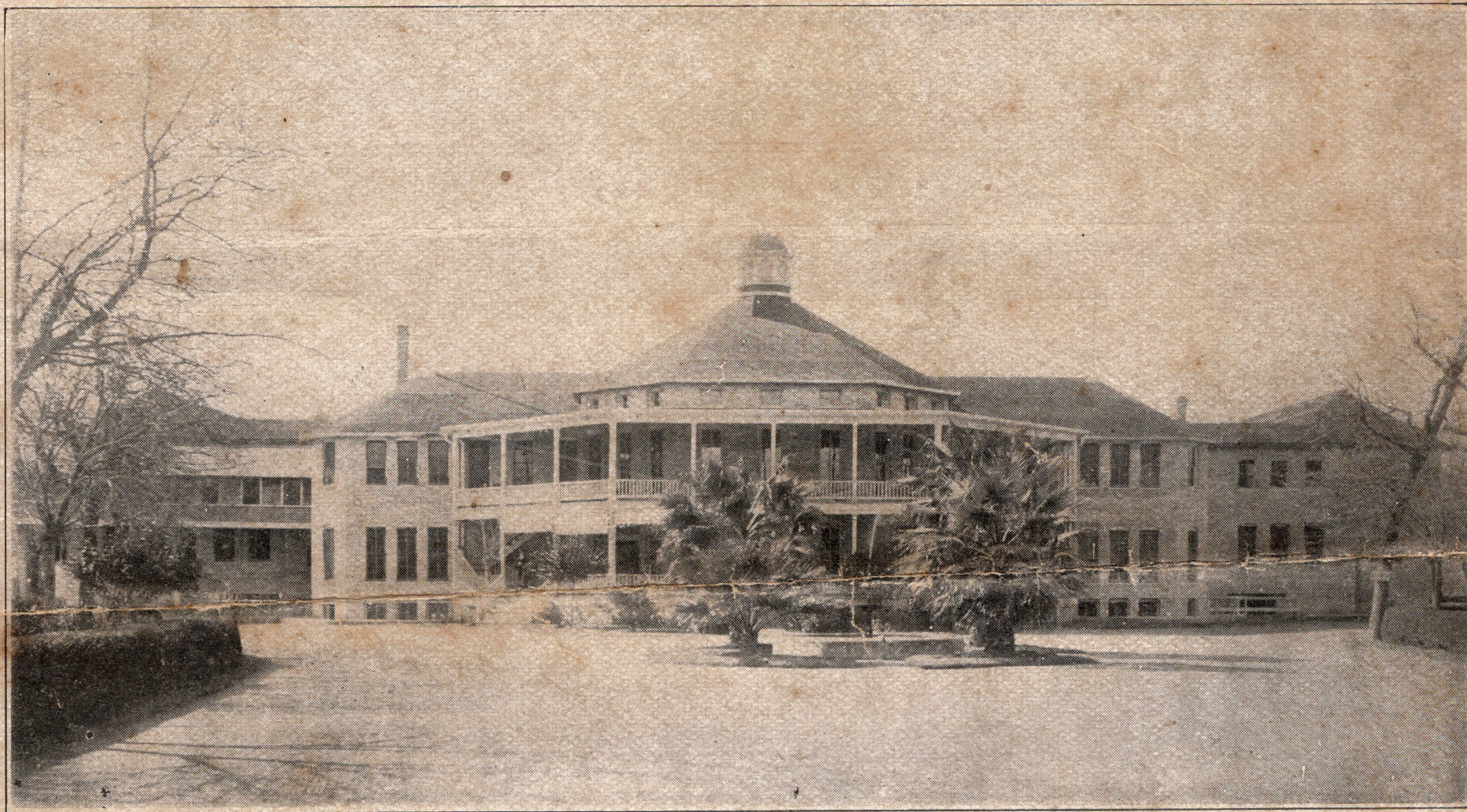
HOT SULPHUR WELLS BATH HOUSE